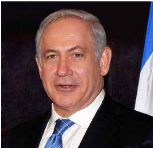
Prime Minister Netanyahu's UN Speech, September 27, 2018

https://www.youtube.com/watch?v=B7ZPPaeMmmA