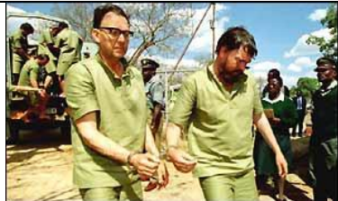
White farmers in Zimbabwe now oppressed by President Mugabe.