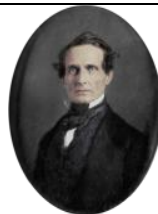
Jefferson Finis Davis (June 3, 1808 – December 6, 1889) President of the Confederacy