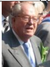
Jean-Marie Le Pen